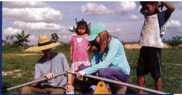
DAY 4 • Wednesday, December 2