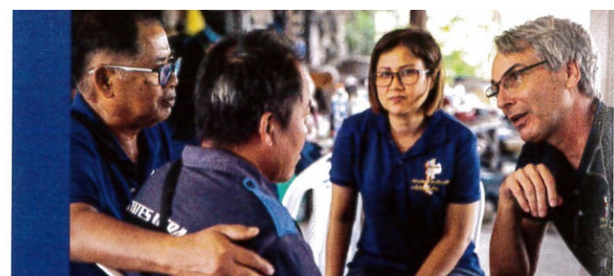
DAY 3 • Tuesday, December 1