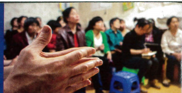
DAY 5 • Thursday, December 3