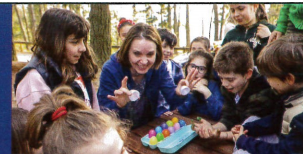
DAY 6 • Friday, December 4