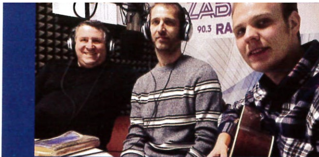
DAY 2 • Monday, November 30