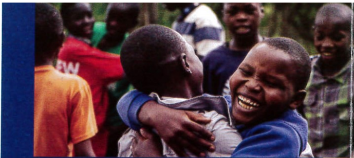
DAY 1 • Sunday, November 29